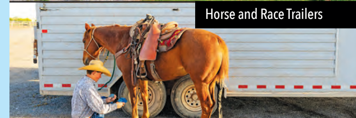
Horse and Race Trailers